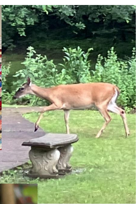
JUST ANOTHER WONDERFUL DAY AT THE MUSEUM